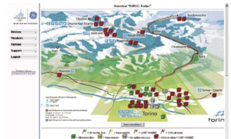
Graphical status overview